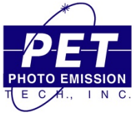
Photo Emission Tech., Inc.

760 Calle Plano, Camarillo, CA 93012 USA