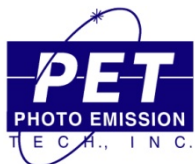
Photo Emission Tech., Inc.

760 Calle Plano, Camarillo, CA 93012 USA