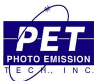
Photo Emission Tech., Inc.

760 Calle Plano, Camarillo, CA 93012 USA