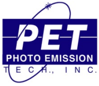
Photo Emission Tech., Inc.

760 Calle Plano, Camarillo, CA 93012 USA