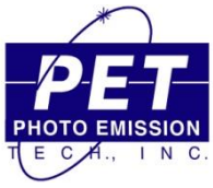
Photo Emission Tech., Inc. 862 Patriot Drive Unit F, Moorpark, CA 93021 USA Tel: (805) 482-5200 Fax: (805) 482-5252 Email: pet@photoemission.com