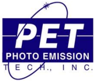
Photo Emission Tech., Inc. 862 Patriot Drive Unit F, Moorpark, CA 93021 USA Tel: (805) 482-5200 Fax: (805) 482-5252 Email: pet@photoemission.com