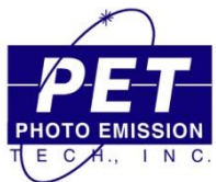
Photo Emission Tech., Inc. 862 Patriot Drive Unit F, Moorpark, CA 93021 USA Tel: (805) 482-5200 Fax: (805) 482-5252 Email: pet@photoemission.com