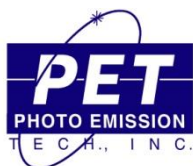
Photo Emission Tech., Inc. 862 Patriot Drive Unit F, Moorpark, CA 93021 USA Tel: (805) 482-5200 Fax: (805) 482-5252 Email: pet@photoemission.com